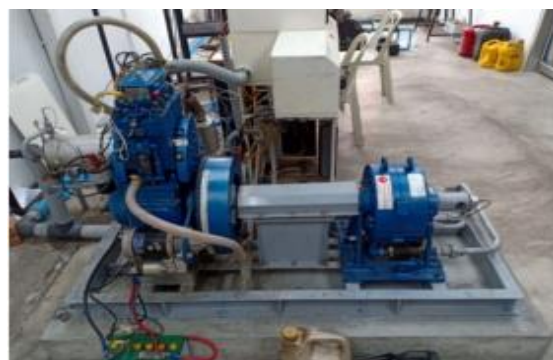
Figure: Diesel Engine Test Rig

The engine shown in plate. 2.1 is a 4 stroke, vertical, single cylinder, water cooled and constant speed diesel engine which is coupled to rope brake drum arrangement to absorb the power produced. The engine crank started. Necessary dead weights and spring balance are included to apply load on brake drum. Suitable cooling water arrangement for the brake drum is provided. Separate cooling water lines fitted with temperature measuring thermocouples are provided for engine cooling. A measuring system for fuel consumption consisting of a fuel tank, burette, and a 3- way cock mounted on stand and stop watch are provided. Air intake is measured using an air tank fitted with an orifice meter and a water U- tube differential manometer. Also, digital temperature indicator with selector switch for temperature measurement and a digital rpm indicator for speed measurement are provided on the panel board. A governor is provided to maintain the constant speed.